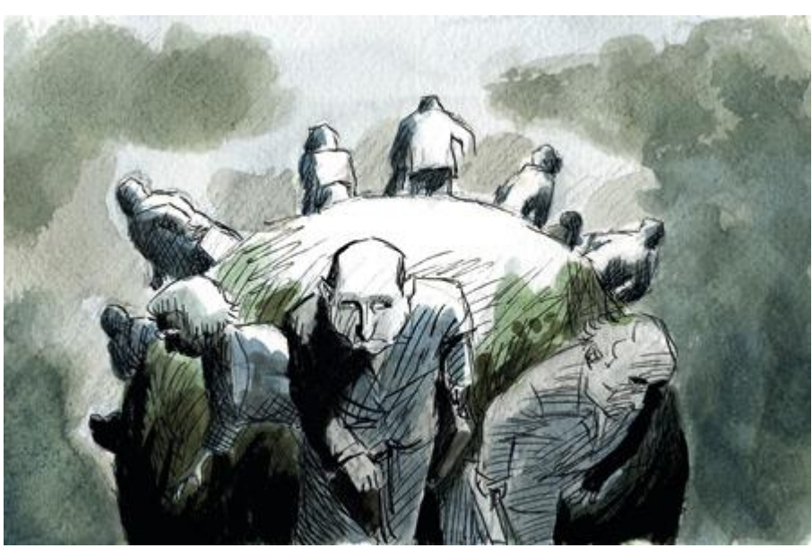
Illustration by Claudio Munoz